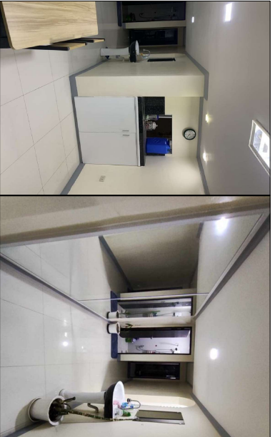
• Toilet and Bath Rooms