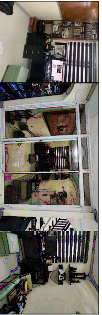
• Office/Computer Room