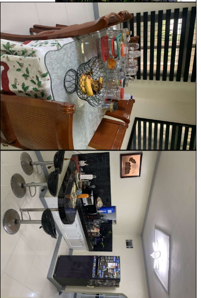
• Dining Room