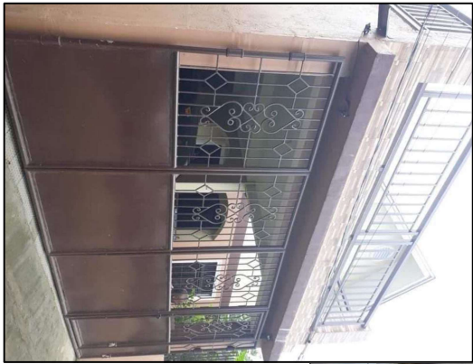
• Main Entrance Gate