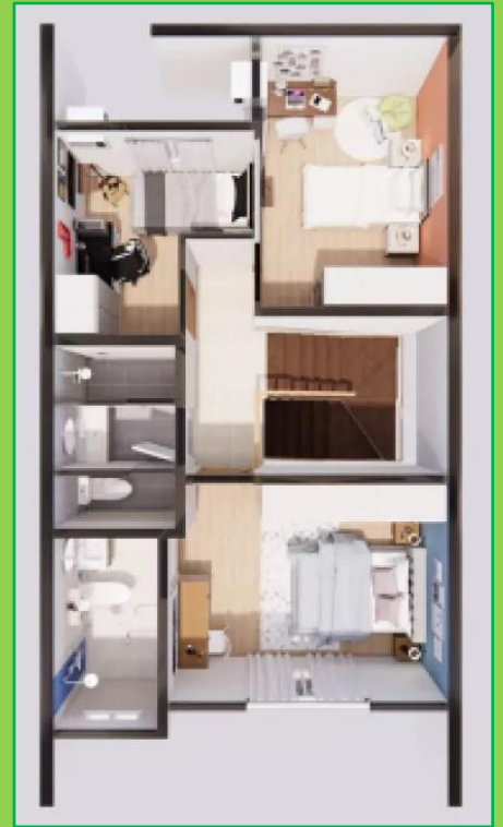
3 rd FLOOR