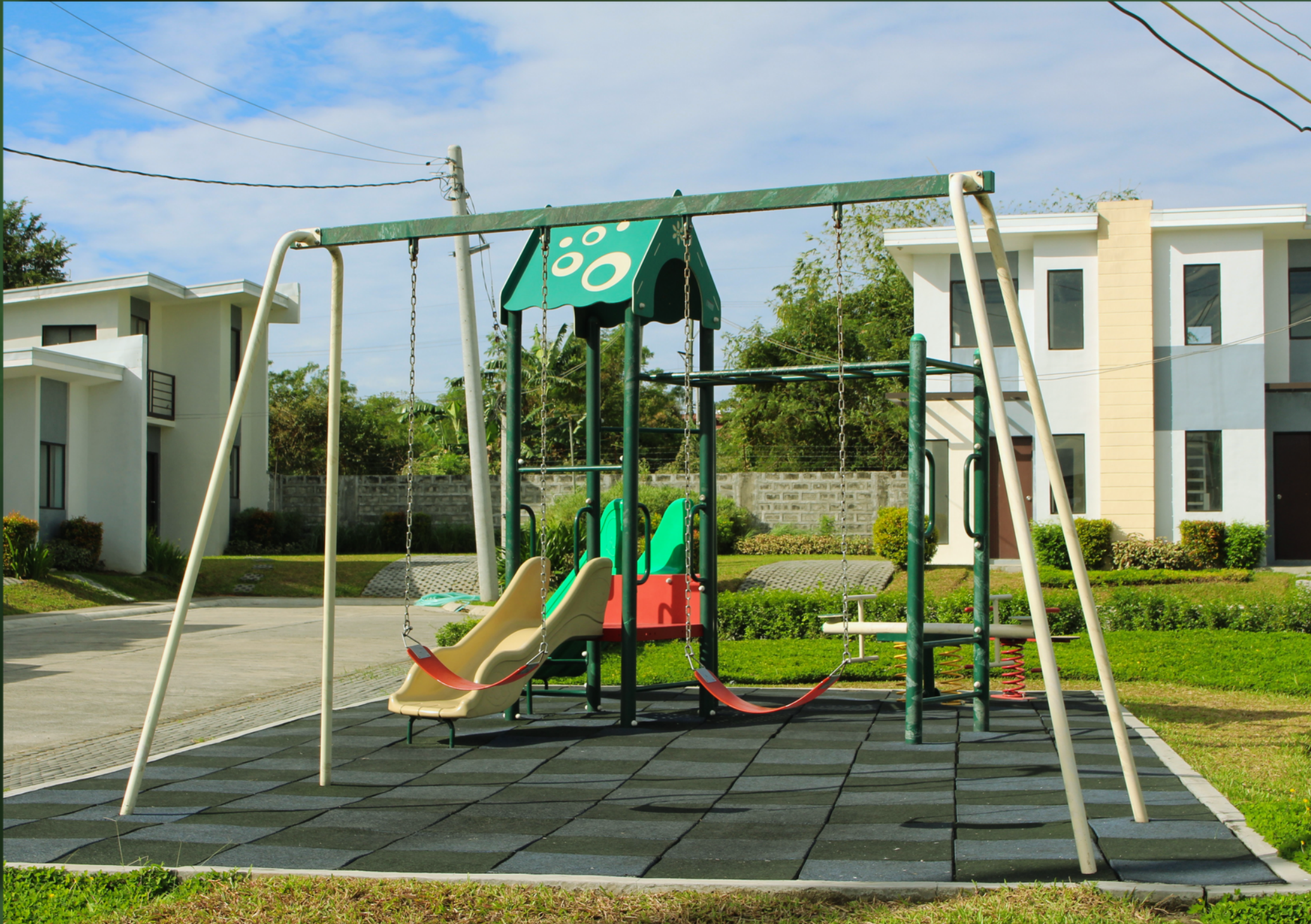
Actual Photo of Play Area