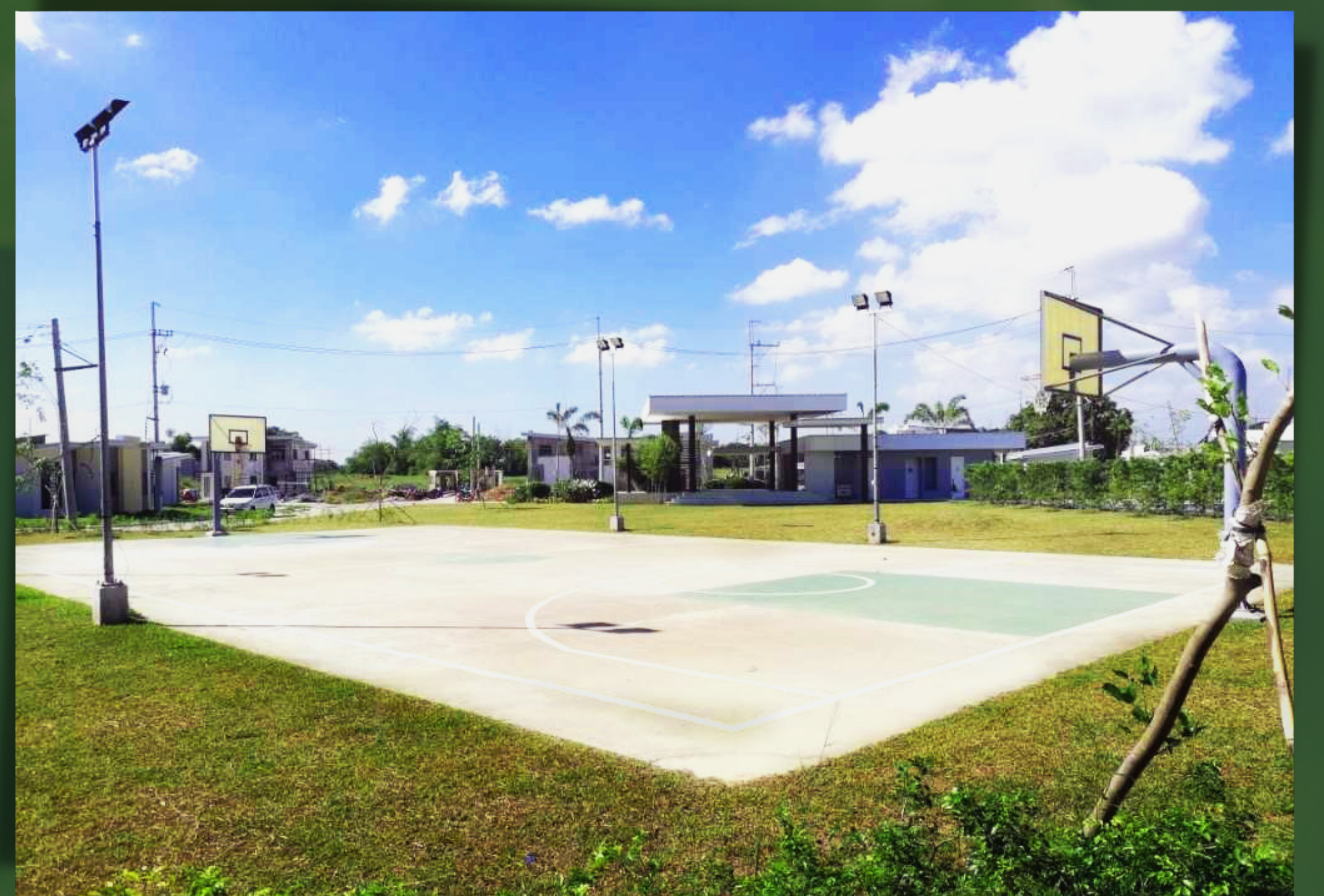
Actual Photo of Basketball Court

Come home to a community with fully developed amenities that you and your family can enjoy when you spend your weekend or celebrate life's milestones at the comfort of your home. Amaia Scapes Bulacan offers not only quality and sustainable homes but also elevates the lifestyle that your family deserved. Take a stroll in the play area within the safe and secured community of Amaia. Bond with your family and friends at the basketball court to live a healthier lifestyle. Beat the summer heat and take a swim in the swimming pool exclusively for you.