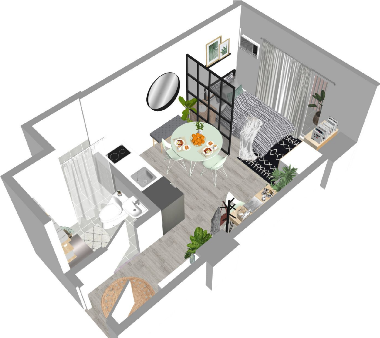
Note: Suggested Floor Layout