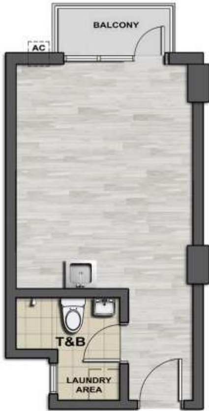
STUDIO | 22-26 sqm