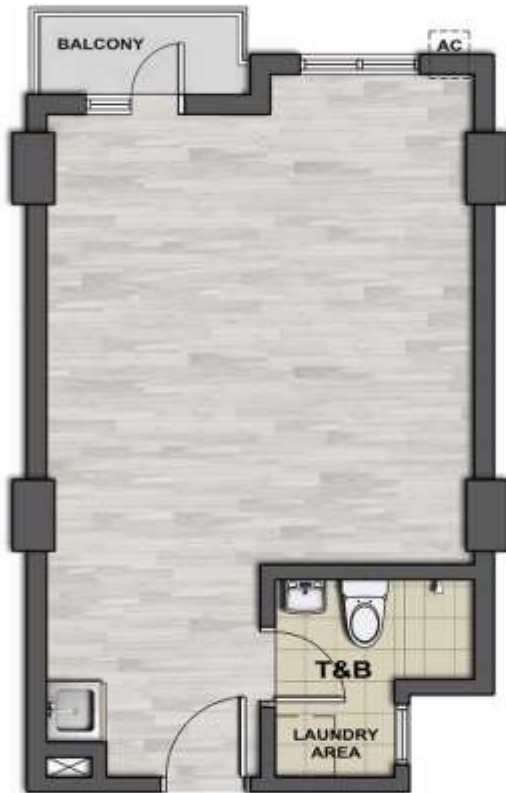
DE LUXE | 31-33 sqm