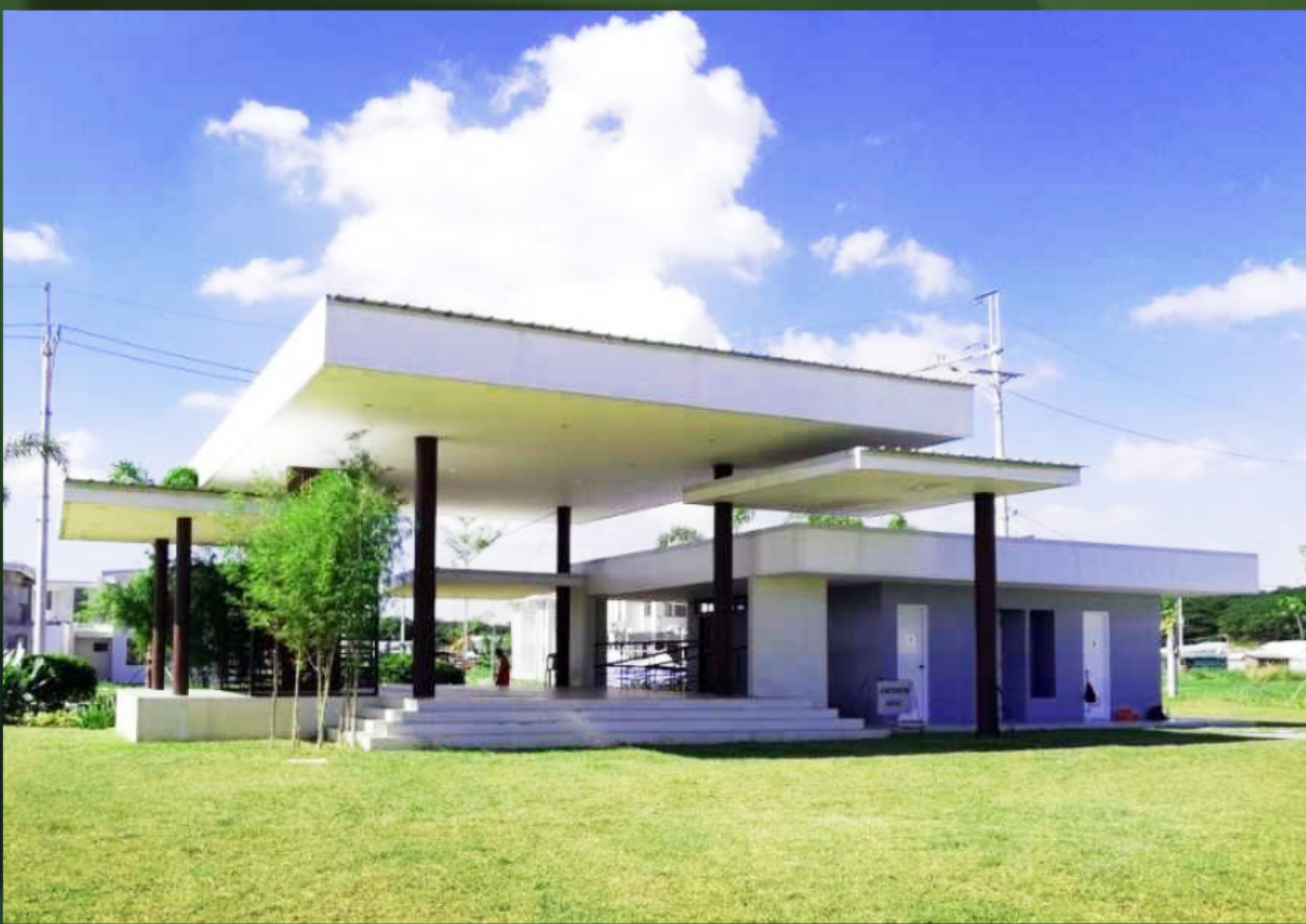
Actual Photo of Village Pavilion