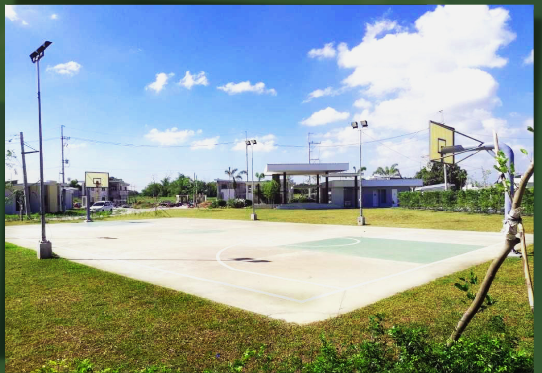
Actual Photo of Basketball Court

Come home to a community with fully developed amenities that you and your family can enjoy when you spend your weekend or celebrate life's milestones at the comfort of your home. Amaia Scapes Bulacan offers not only quality and sustainable homes but also elevates the lifestyle that your family deserved. Take a stroll in the play area within the safe and secured community of Amaia. Bond with your family and friends at the basketball court to live a healthier lifestyle. Beat the summer heat and take a swim in the swimming pool exclusively for you.