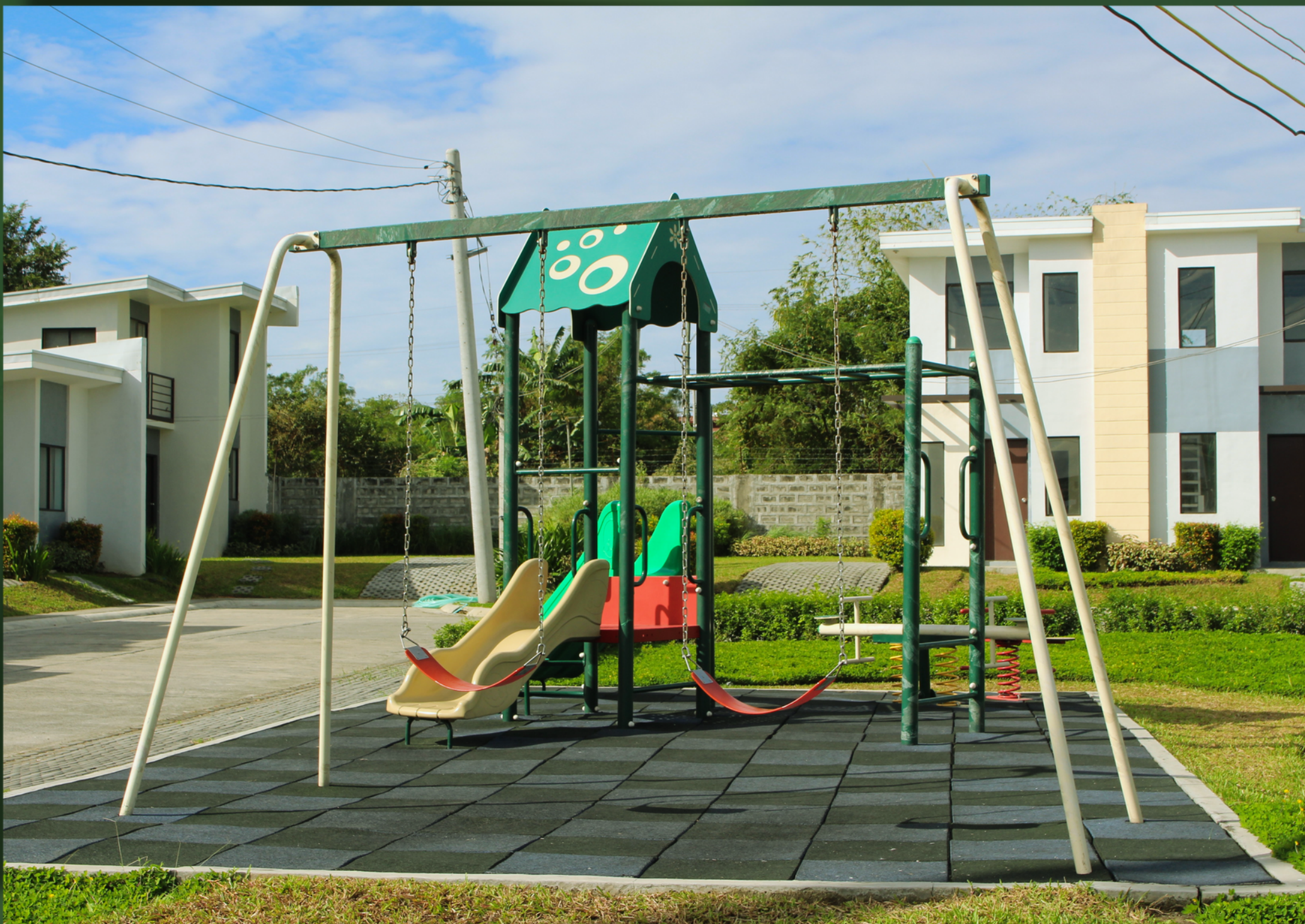
Actual Photo of Play Area