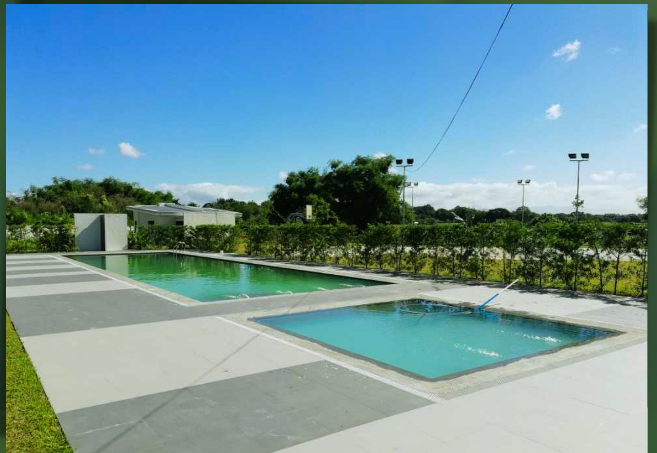
Actual Photo of Swimming Pool