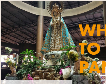
OUR LADY OF ROSARY OF MANAOAG