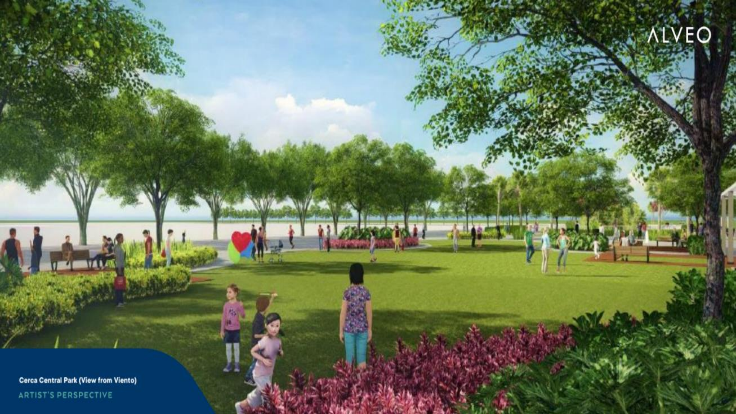
Cerca Central Park (View from Viento) ARTIST'S PERSPECTIVE