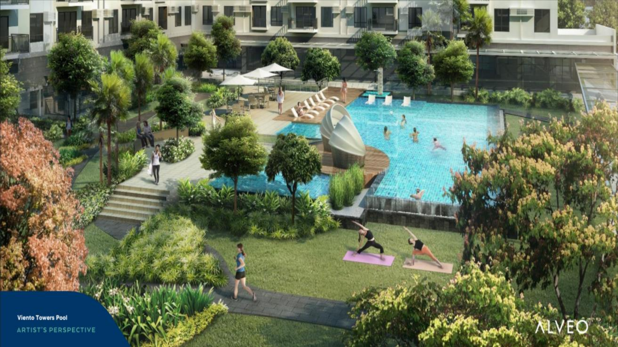
Viento Towers Pool ARTIST'S PERSPECTIVE