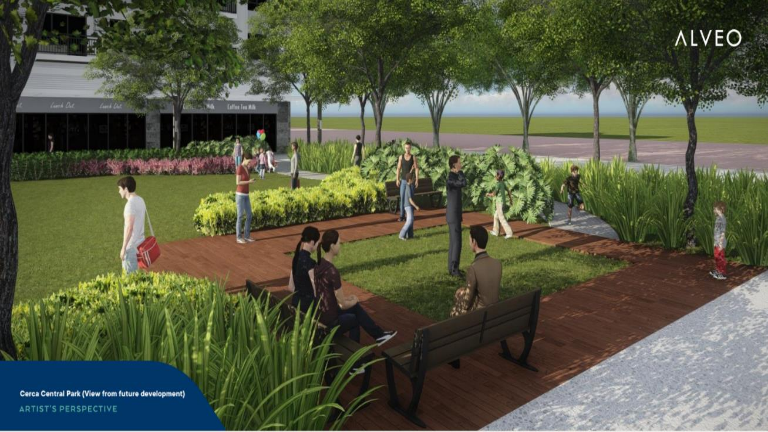
Cerca Central Park (View from future development)