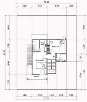
SECOND FLOOR PLAN SCALE 1:100 M FLOOR AREA: 53.57 SQ.M./UNIT

Instant living made easy! Explore our move-in ready homes. No waiting needed, just start creating memories!