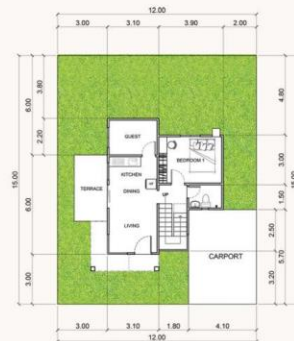
GROUND FLOOR PLAN SCALE 1:100 M FLOOR AREA: 47.47 SQ.M./UNIT