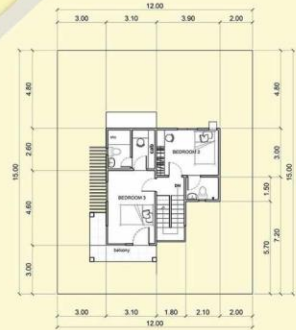
SECOND FLOOR PLAN SCALE 1:100 M FLOOR AREA: 53.57 SQ.M./UNIT