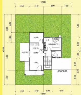
GROUND FLOOR PLAN SCALE 1:100 M FLOOR AREA: 47.47 SQ.M./UNIT