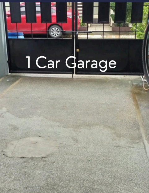
1 Car Garage