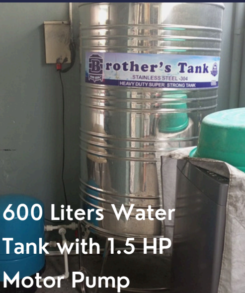
600 Liters Water Tank with 1.5 HP Motor Pump