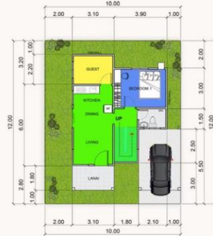
GROUND FLOOR PLAN FLOOR AREA: 63.05 SQ.M. FLOOR AREA WITH CARPORT AREA: 70.10 SQ.M.