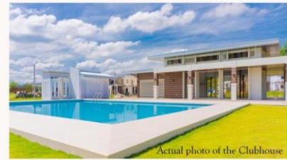
Actual photo of the Clubhouse