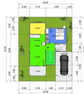
Ground Floor Plan FLOOR AREA: 53.05 SQ.M. FLOOR AREA WITH CARPORT AREA: 70.10 SQ.M.