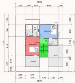
SECOND FLOOR PLAN FLOOR AREA: 49.95 SQ.M.

Elevate your lifestyle instantly with our ready for occupancy homes. Your perfect home is ready to welcome you.