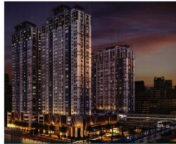
SAN LORENZO PLACE Makati City