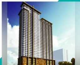
MANGO TREE RESIDENCES San Juan City