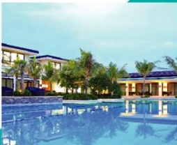
THE SONOMA Sta. Rosa City