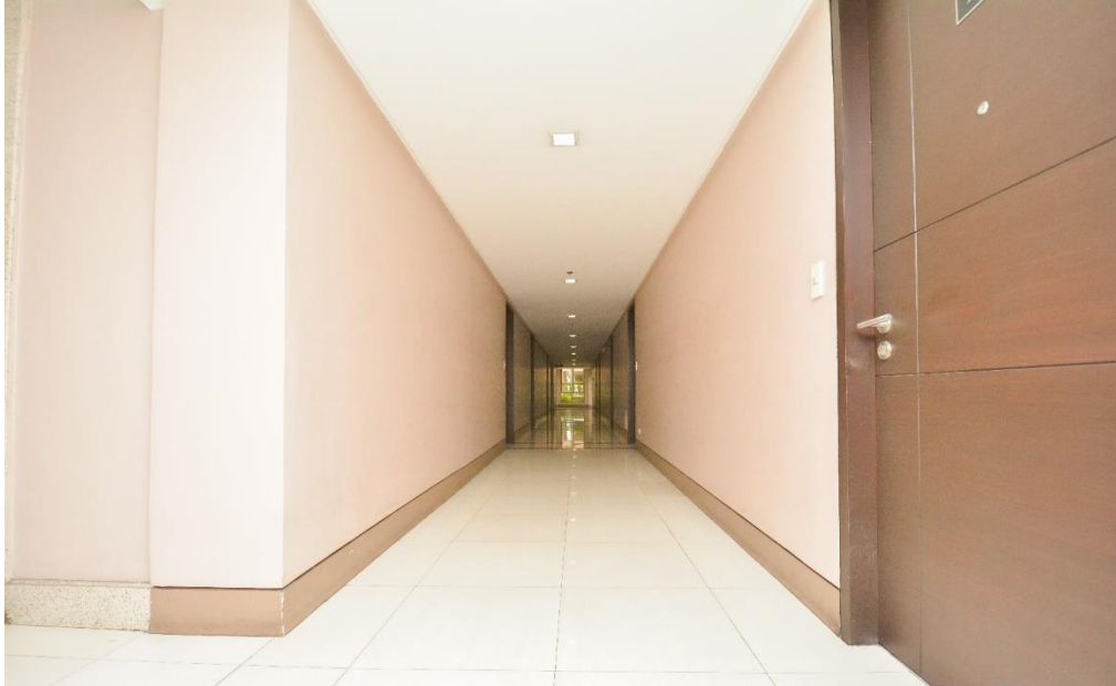
Hallway - residential levels