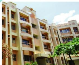
LITTLE BAGUIO GARDENS San Juan City