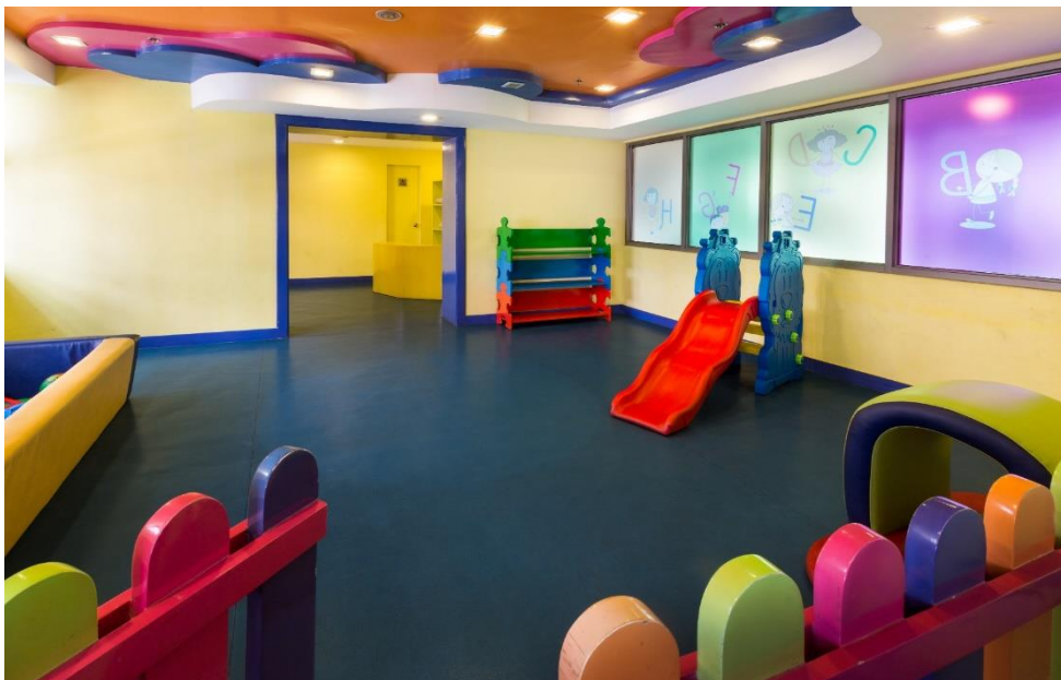
Day Care Center