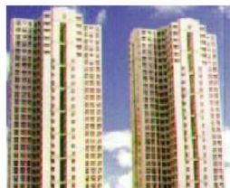
KINGSWOOD MAKATI Makati City