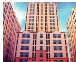
GREENHILLS GARDEN SQUARE Quezon City