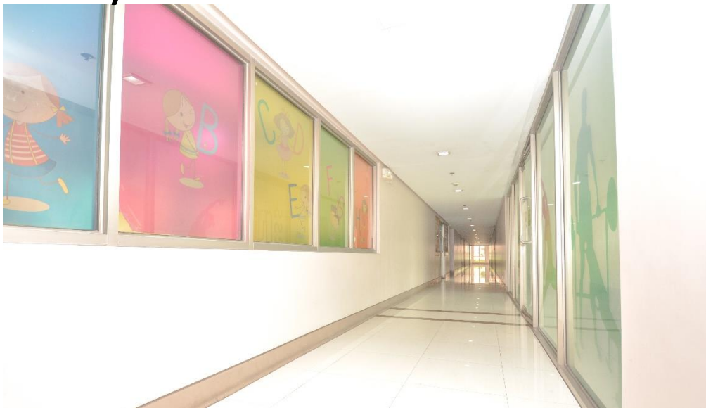
Hallway - amenity level