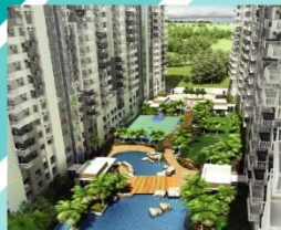
KASARA URBAN RESORT RESIDENCES Pasig City