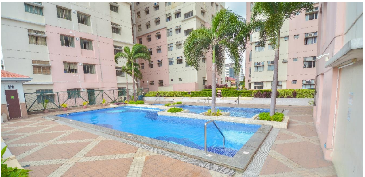
15-meter lap pool with kiddie pool and Jacuzzi