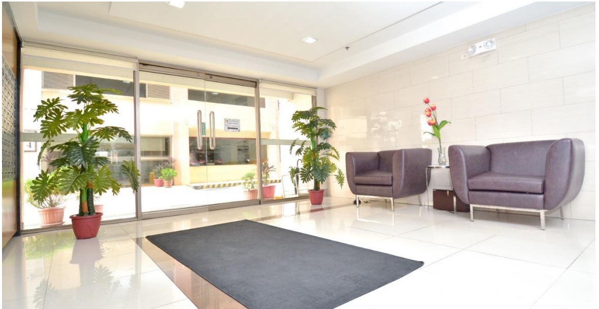
Residential lobby with mail area