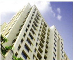
GILMORE HEIGHTS Quezon City