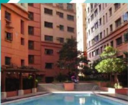
SAN FRANCISCO GARDENS Mandaluyong City