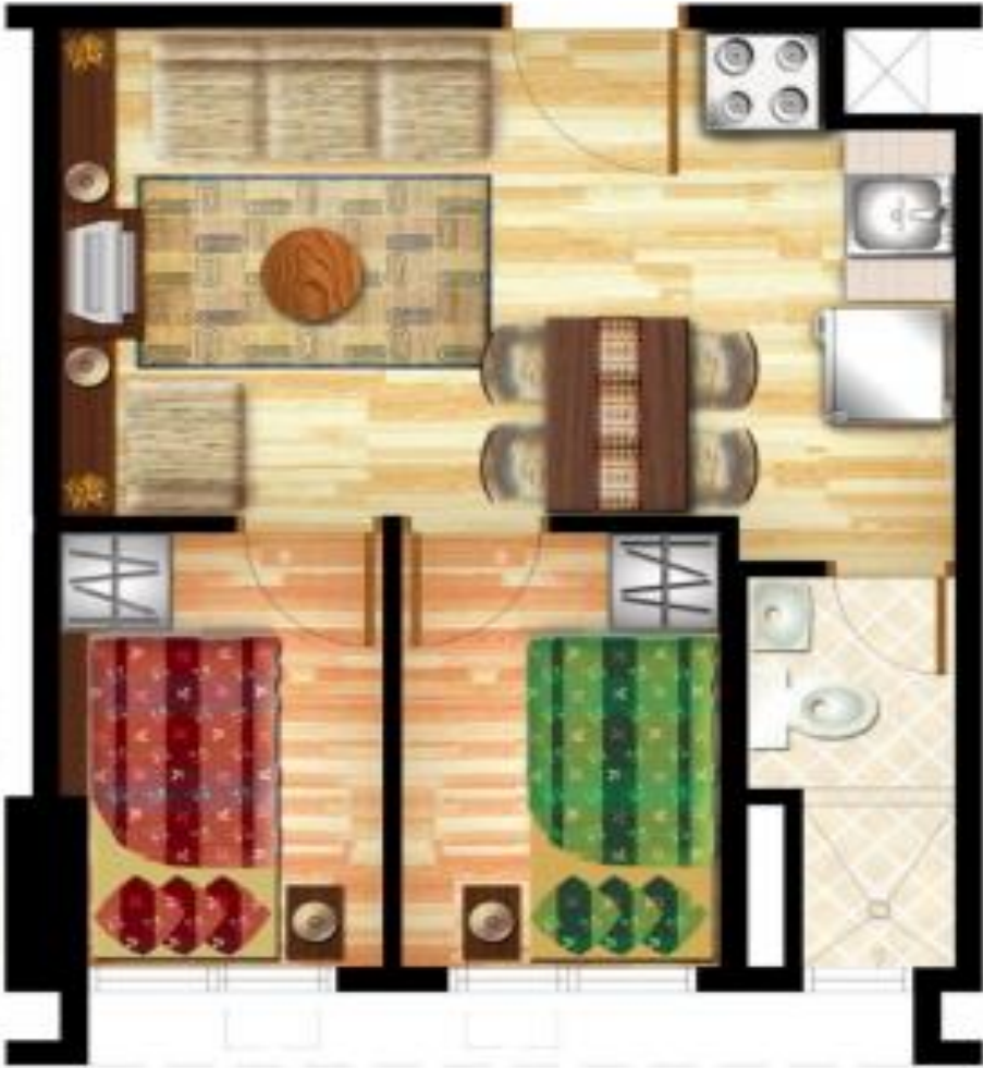
INNER UNIT – 30 SQ.M.