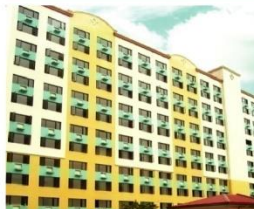
THE CAMBRIDGE VILLAGE Pasig-Cainta area