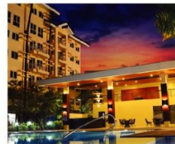
THE ROCHESTER Pasig City