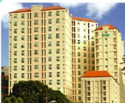
THE XAVIER HILLS Quezon City