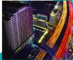
PIONEER WOODLANDS Mandaluyong City