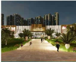
EMPIRE EAST HIGHLAND CITY Pasig-Cainta area