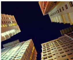
LITTLE BAGUIO TERRACES San Juan City