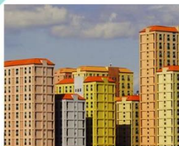
CALIFORNIA GARDEN SQUARE Mandaluyong City