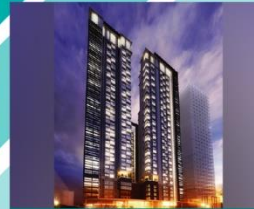
THE PADDINGTON PLACE Mandaluyong City