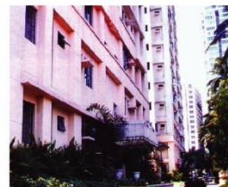
GOVERNOR'S PLACE Mandaluyong City