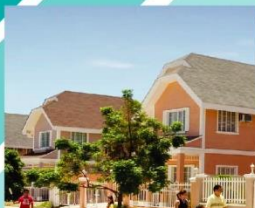
LAGUNA BEL-AIR Sta. Rosa City