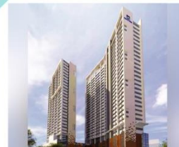
COVENT GARDEN Sta. Mesa, Manila