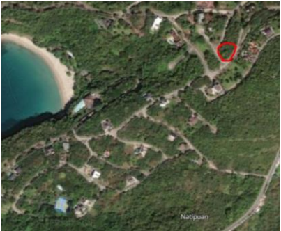
Lot Location 5 mins from Beach