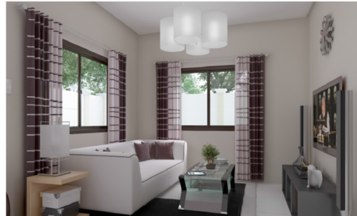
Architect's perspective of Entertainment Room