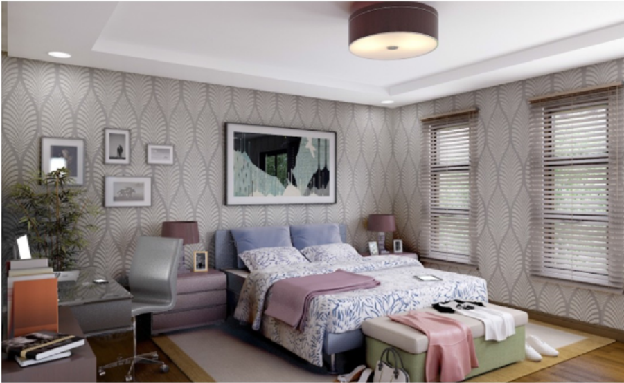
Architect's perspective of Master Bedroom