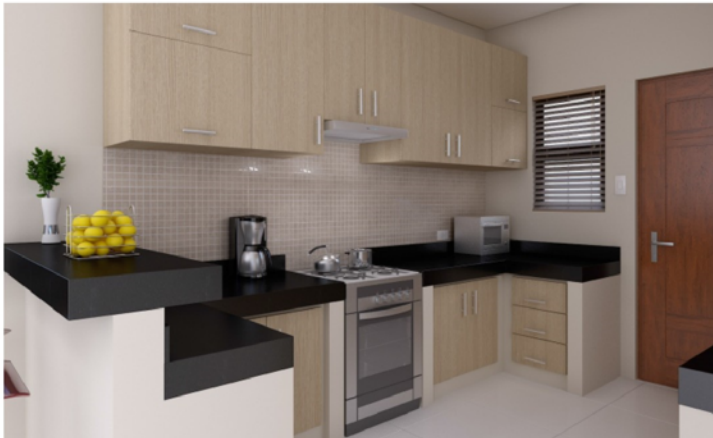
Architect's perspective of Kitchen