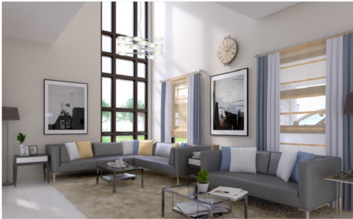
Architect's perspective of Living