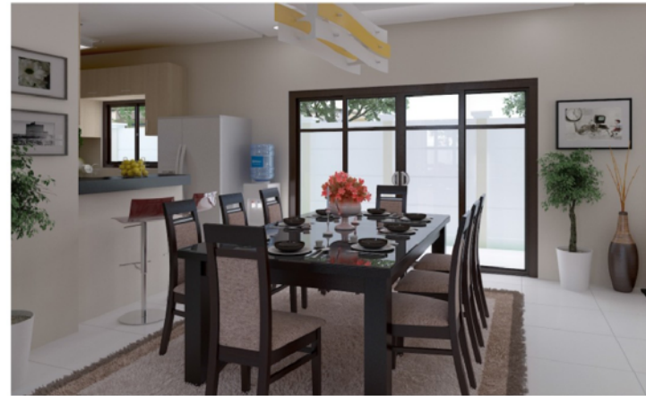
Architect's perspective of Dining