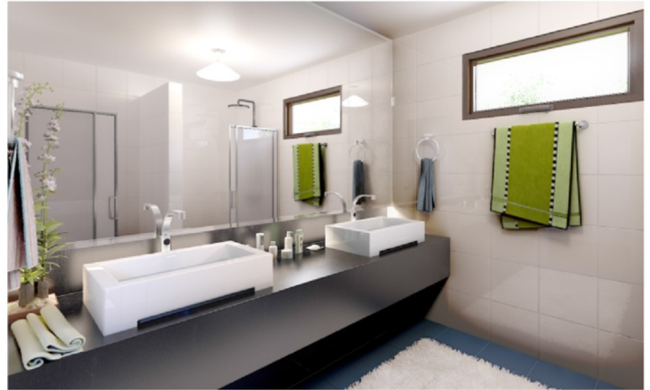
Architect's perspective of Comfort Room