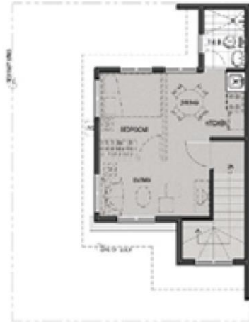
GROUND LEVEL PLAN SECOND LEVEL PLAN