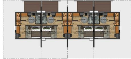
2-STOREY MULTIPOD SECOND FLOOR PLAN