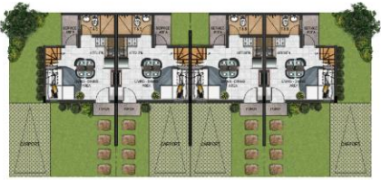
2-STOREY MULTIPOD GROUND FLOOR PLAN