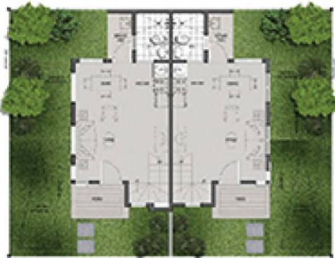
GROUND LEVEL PLAN