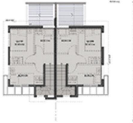
SECOND LEVEL PLAN