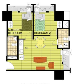
2 - BEDROOM (56.58 SQ.M.58 SQ.M. - 60.76 SQ.M.)