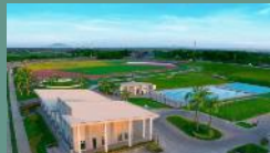
VERMOSA SPORTS HUB