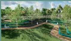
PARKS & OPEN SPACES