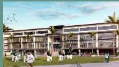
DE LA SALLE ZOBEL-VERMOSA