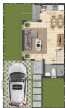
TYPICAL GROUND FLOOR PLAN SINGLE UNIT