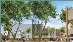
AYALA MALLS VERMOSA