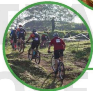
NEAR THE FIELDS

OFF-ROAD BIKING Approximately 50 kilometers in length, NUVALI's off-road biking and running trails offer scenic view of the NUVALI terrain. Register and leave a valid ID at the Fields clubhouse.