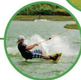
AT REPUBL1C WAKEPARK

WAKE BOARDING Enjoy wakeboarding sans the long sojourn out of the city at the state-of-the-art REPUBL1C Wakepark. For more information visit their website: republ1cwakepark.com