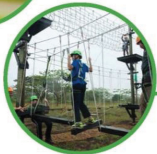
CAMP N' GREENS AND PATCHES

TEAM BUILDING AND CAMPING Families and kids can tour around this area to learn about the different kinds of trees and plants. They can also rent a nipa hut to enjoy a cooked meal with ingredients harvested from the garden.