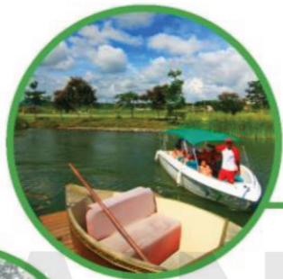
AT SOLENAD 1

BOATING Enjoy the sceneries in NUVALI through a water taxi ride for Php 30 per head, from 8:00AM to 5:00PM everyday.