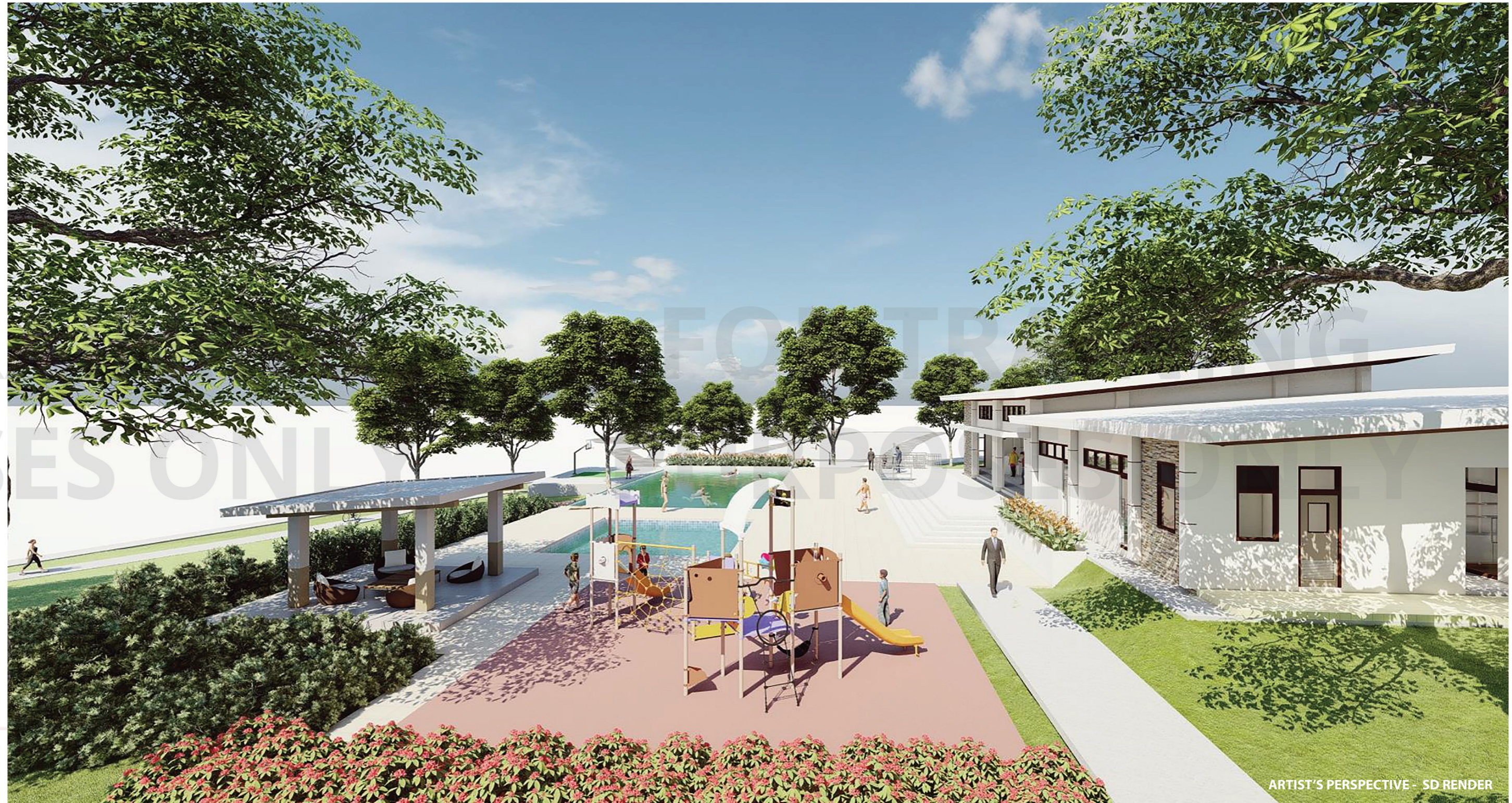
ARTIST'S PERSPECTIVE - SD RENDER