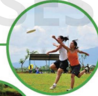
AT THE FIELDS

ENGAGING IN FIELD SPORTS Playing sports amidst a close-to-nature setting is always possible with NUVALI's wide sports ground and open fields. Facilities are available for reservation and booking.