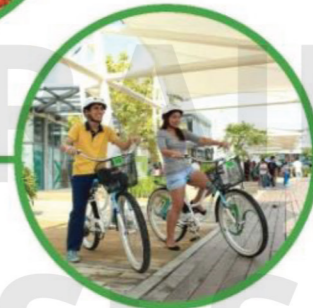
AT LAKESIDE EVOZONE

LEISURE BIKING Appreciate the beauty of nature and enjoy leisure biking with family and friends by renting a bike for Php60 an hour. Wearing of appropriate biking footwear is encouraged.