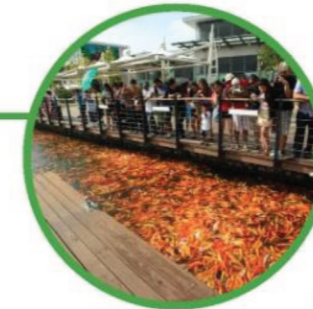
AT SOLENAD 1

FISH FEEDING Get to feed the Koi by buying feeds for Php15. Official fish feeding time is from 8:00AM to 5:00PM everyday.