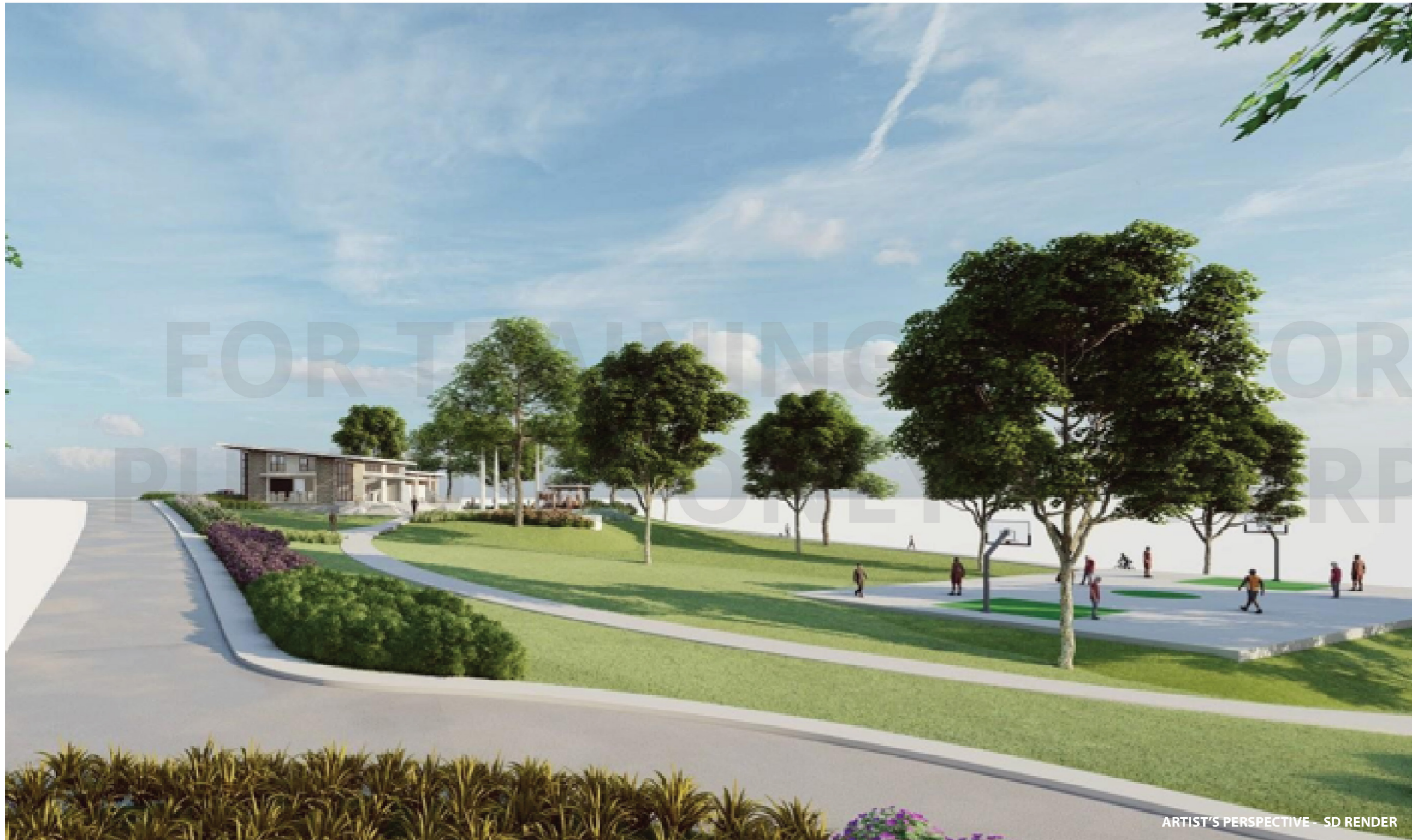
ARTIST'S PERSPECTIVE - SD RENDER