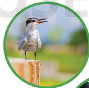
AT WILD LIFE AND BIRD SANCTUARY

TREKKING AND BIRD WATCHING Visitors can hang around the view deck at the Wildlife and Bird Sanctuary to spot a variety of bird species. It is best to go early morning, from 6:00AM to 8:00AM, or late afternoon from 4:00PM to 5:00PM.