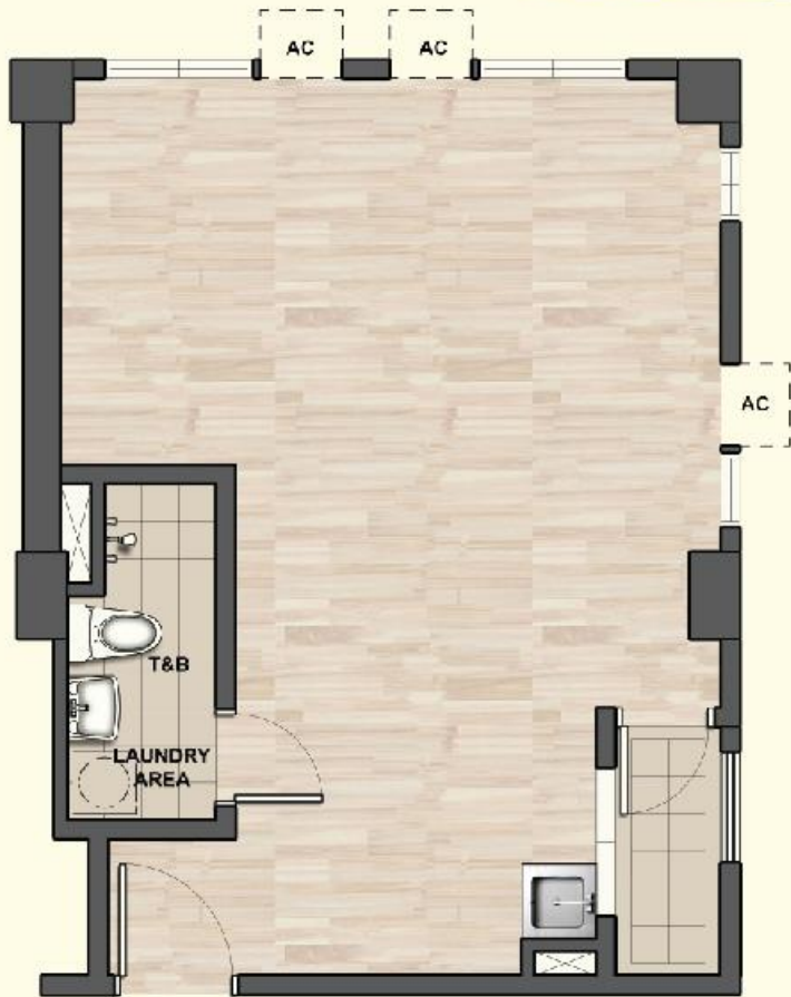
PREMIER UNIT 42 SQM