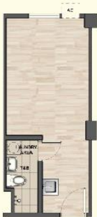
STUDIO UNIT 24.3 SQM