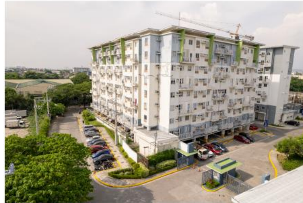
Sufficient Space for Vehicles and Pedestrians