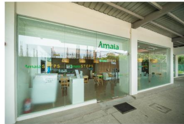
LED Lights in Common Areas