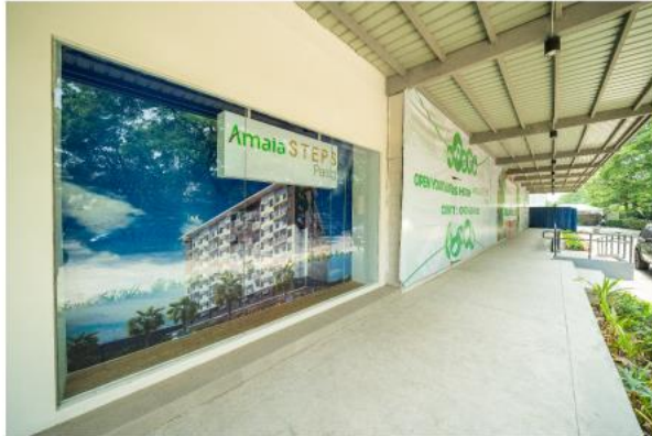
Arcaded Retail Space