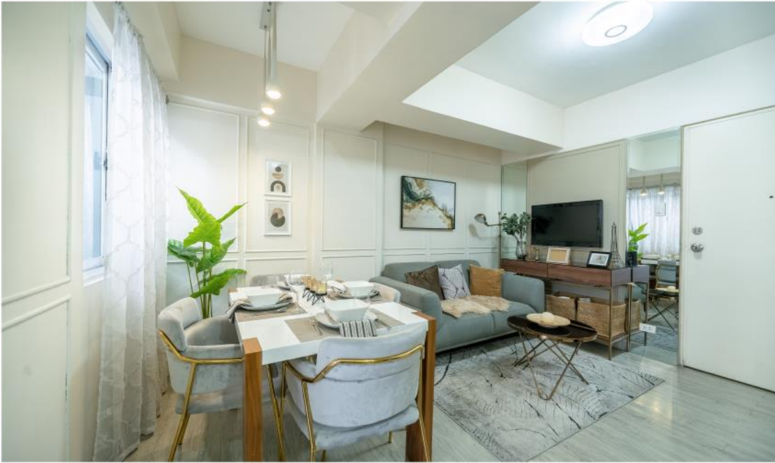
PREMIER 40.56 sqm – 45.47 sqm