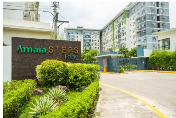
Light-colored Facade and Roof