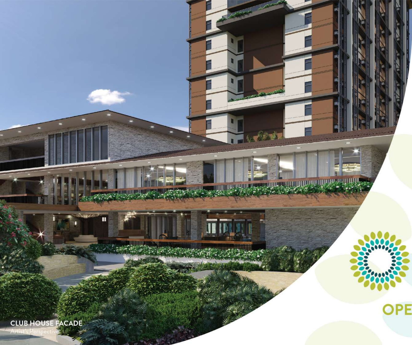
CLUB HOUSE FACADE Artist's Perspective