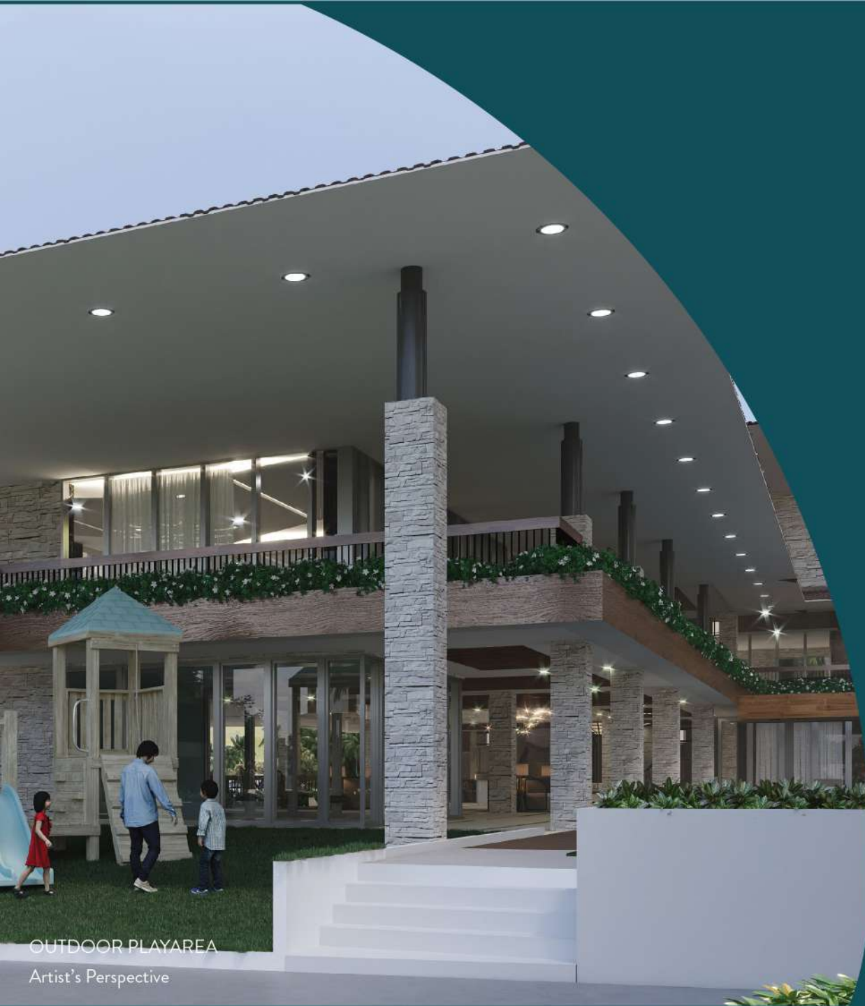
OUTDOOR PLAYAREA Artist's Perspective