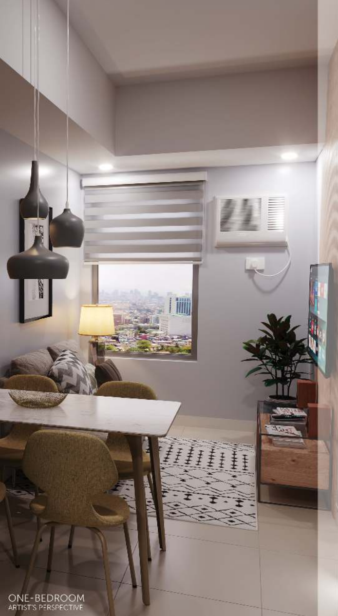
ONE-BEDROOM ARTIST'S PERSPECTIVE