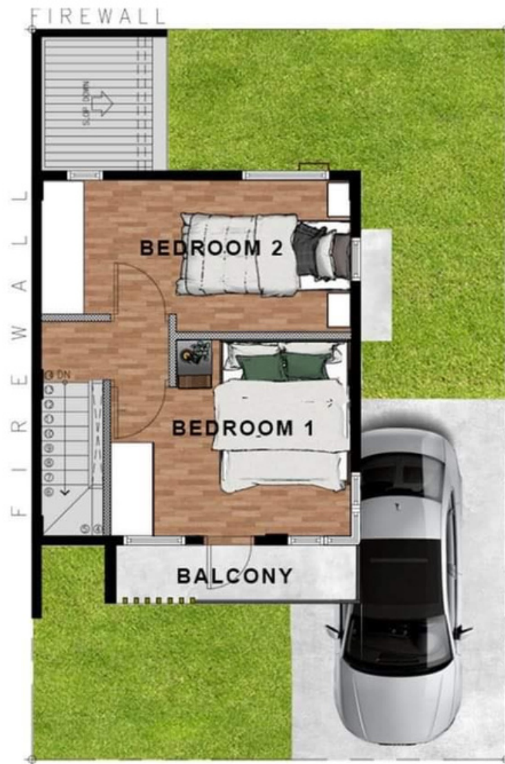
SECOND FLOOR PLAN 26sqm