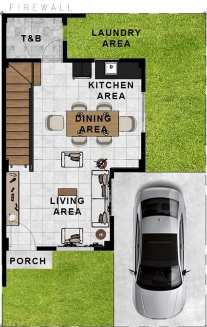
GROUND FLOOR PLAN 24sqm