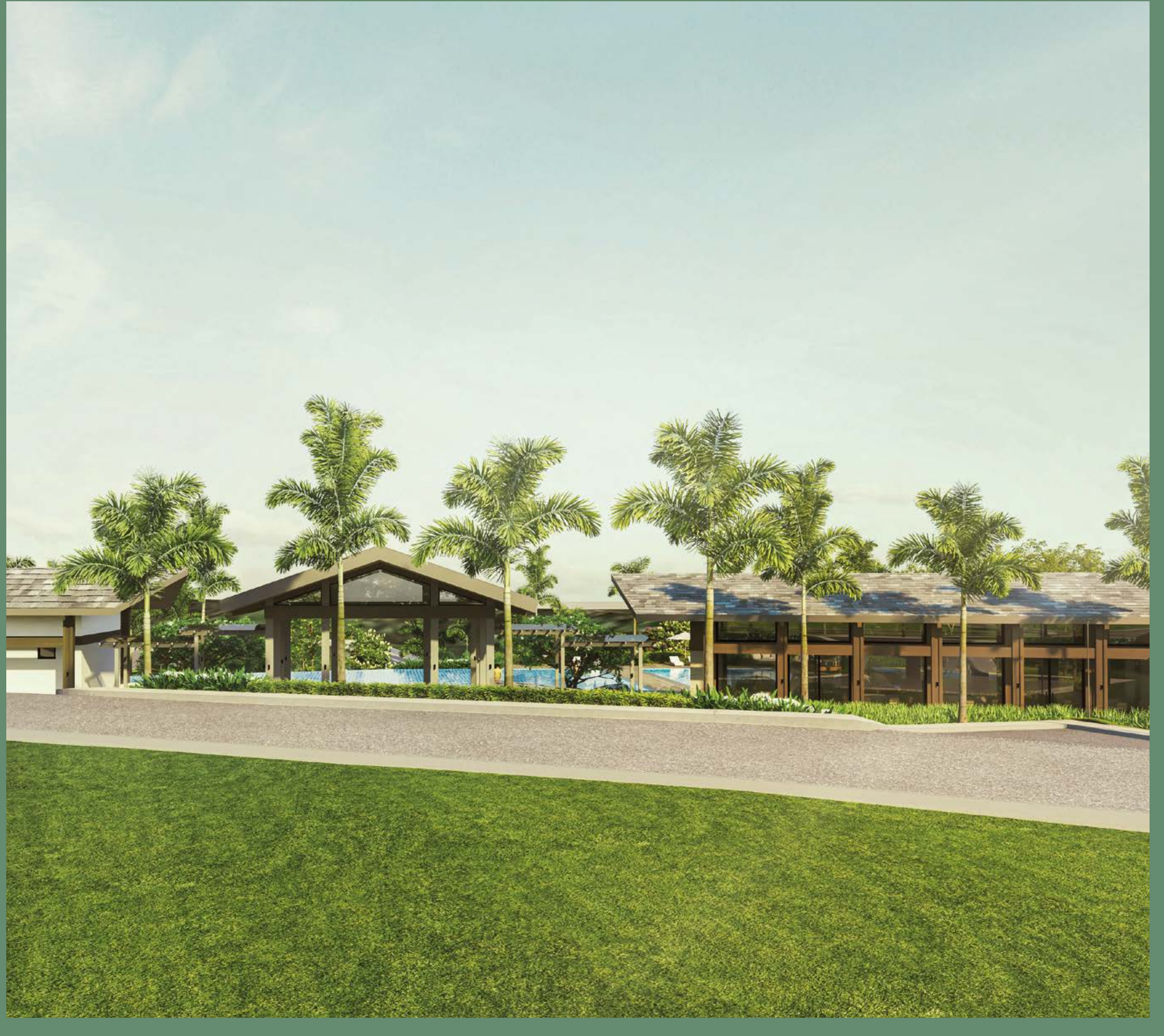
South Palmgrove Clubhous Artist's Perspective

Alveo Land expands the tradition of industry excellence with a commitment to innovation, best realized through fresh lifestyle concepts and living solutions, pushing boundaries in dynamic communities and diverse neighborhoods across the nation.