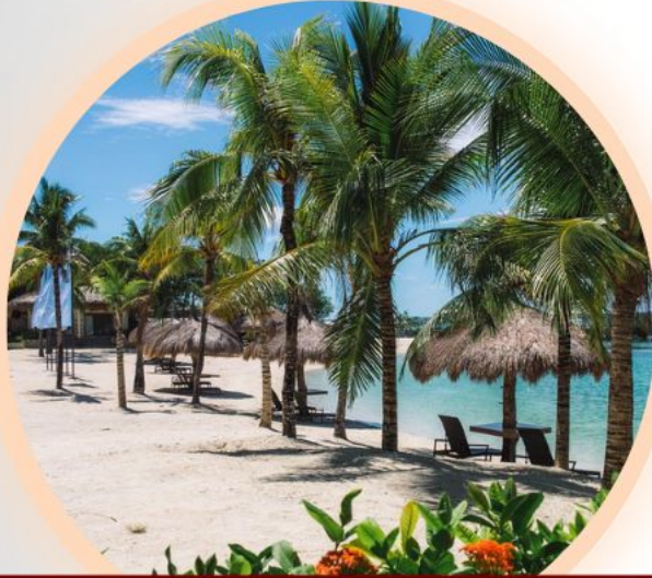
BLUEWATER MARIBAGO BEACH RESORT