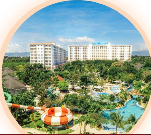
JPARK ISLAND RESORT & WATERPARK