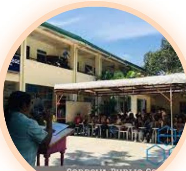
CORDOVA PUBLIC COLLEGE