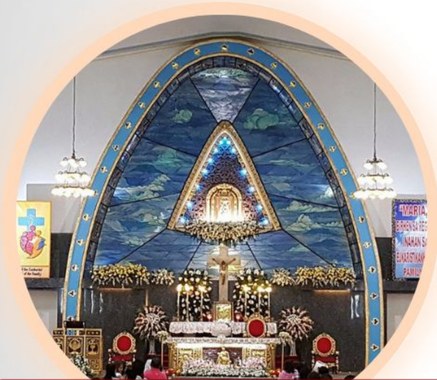
VIRGEN DELA REGLA