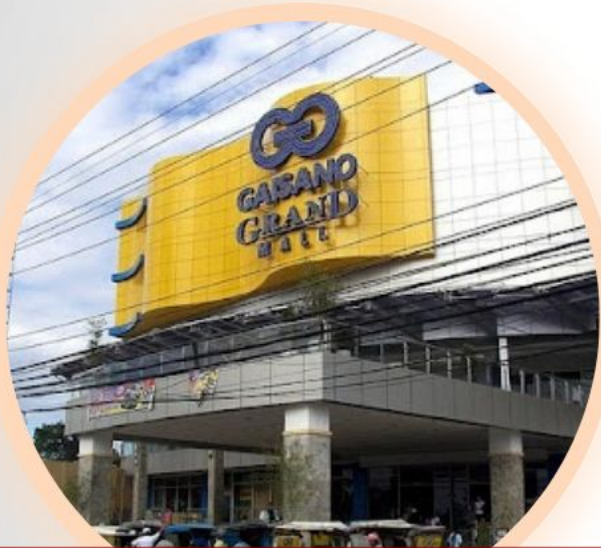
GAISANO GRAND MALL BASAK