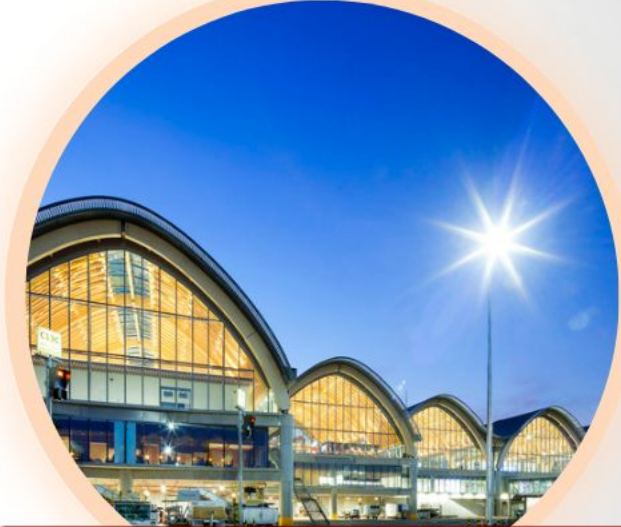
MACTAN INT'L AIRPORT