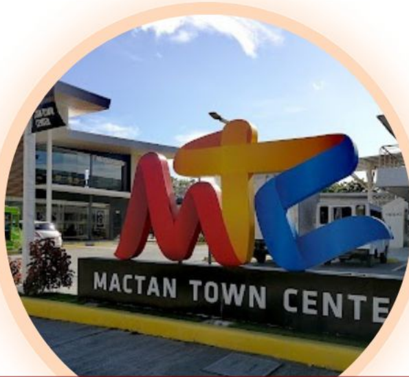
MACTAN TOWN CENTER