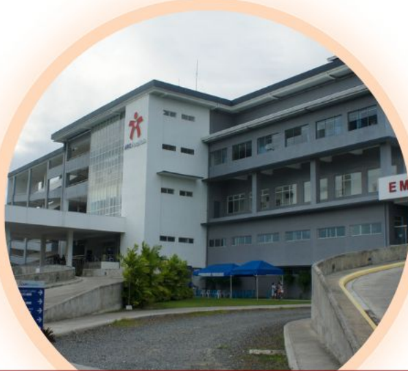
ARC - ALLEGIANT REGIONAL CARE HOSPITAL