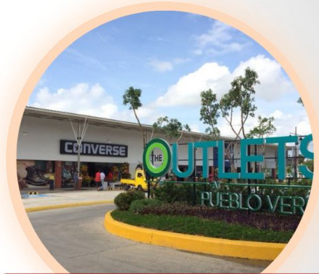
THE OUTLETS AT PUEBLO VERDE