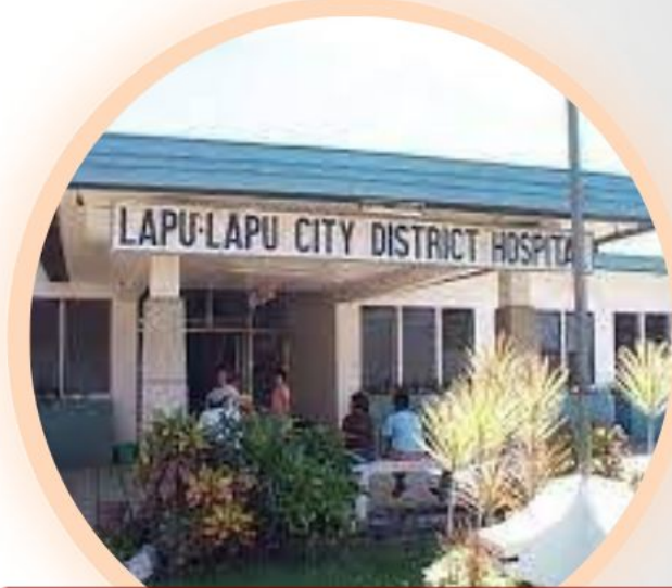
LAPU-LAPU CITY DISTRICT HOSPITAL