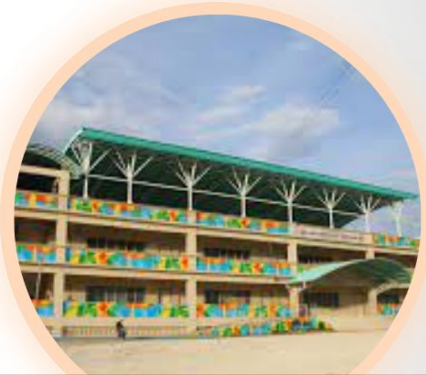
LAPU-LAPU CITY COLLEGE