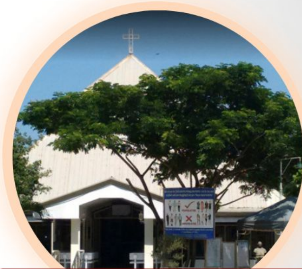
OUR LADY OF SACRED HEART PARISH