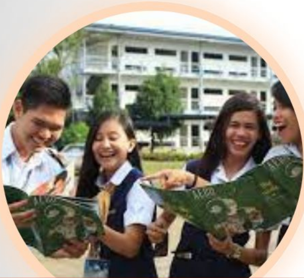
INDIANA AEROSPACE UNIVERSITY