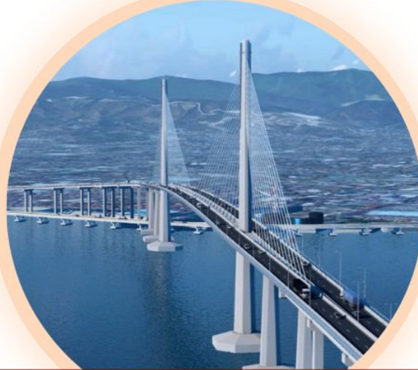
CEBU-CORDOVA LINK EXPRESSWAY