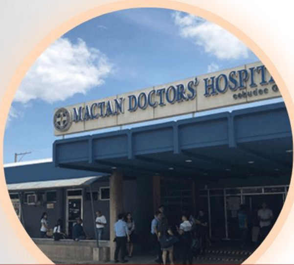
MACTAN DOCTOR'S HOSPITAL