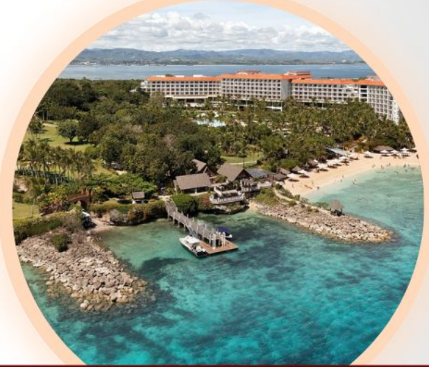
SHANGRI-LA MACTAN, CEBU