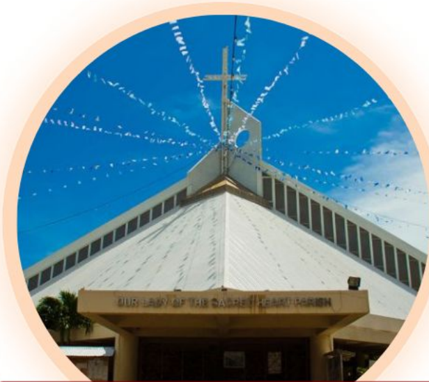
MOTHER OF PERPETUAL HELP PARISH